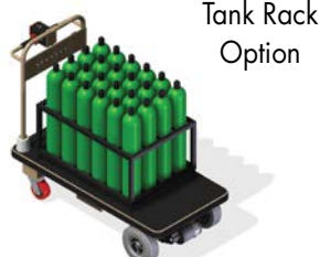
Tank Rack Option