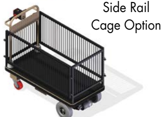
Side Rail Cage Option