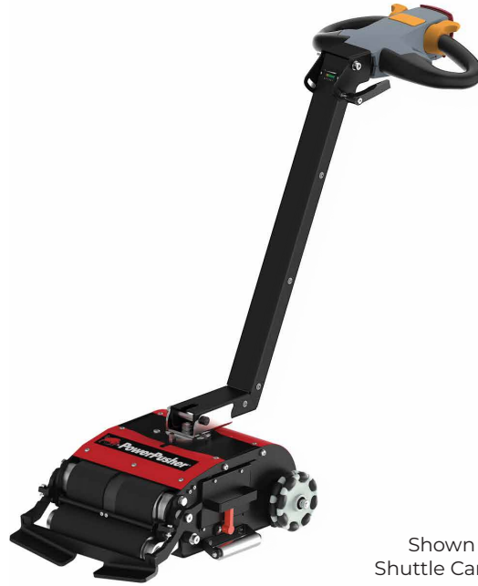
Shown with optional Shuttle Cart Attachment