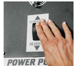
Forward / Reverse Operation