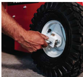
Locking Hub for Free-Wheeling Transport