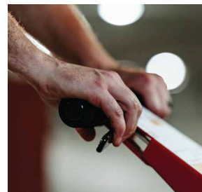
Variable Speed Control