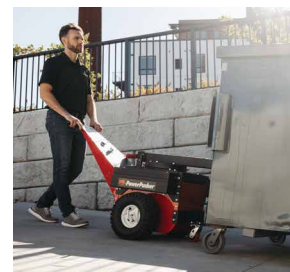
Sealed Transaxle for Stable Operation on Uneven Surfaces