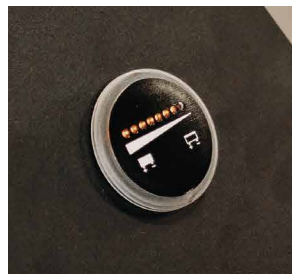
Battery Charge Indicator