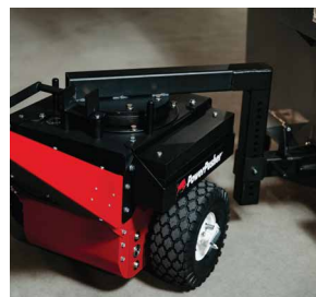
Tight Turning Radius for Confined Spaces