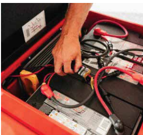
Built in Battery Charger