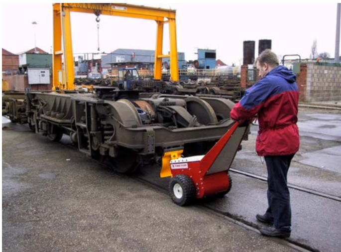
Push Pad Attachment