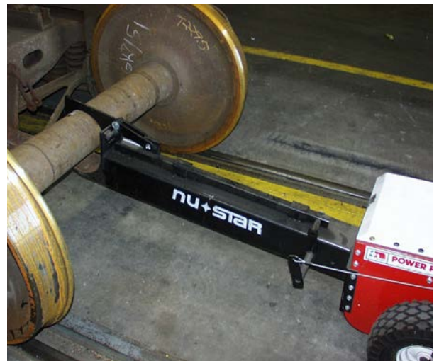
Rail Car Attachment