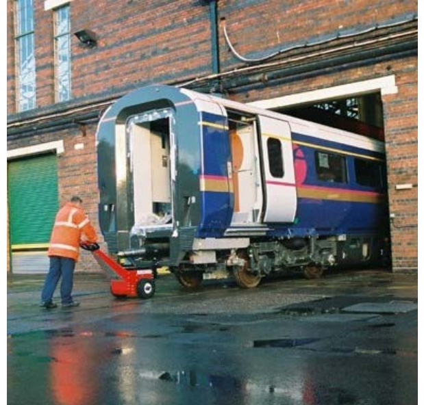
Push Pad Attachment