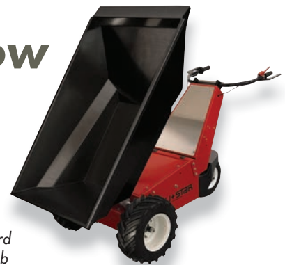
Standard Poly Tub Attachment