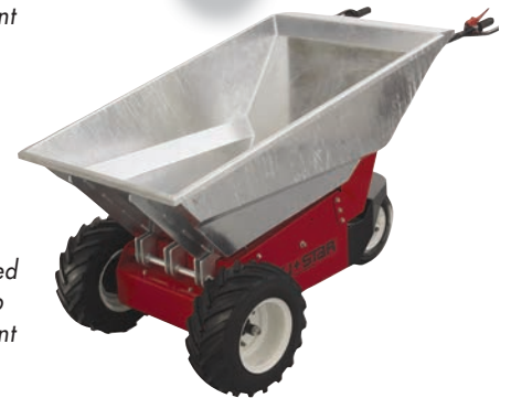
Galvanized Steel Tub Attachment