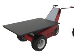
Flatbed - 2 sizes Short: 31" W x 38" L Long: 31" W x 48" L