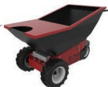
Concrete Funnel Cap